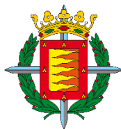
Ayuntamiento de Valladolid

The SGGCYL has been in existence for over 60 years and it is a scientific society with over 2000 associates from over 30 different professional specialties. Their central objective is the welfare of old people.